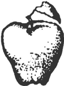
FREDERICK COUNTY TEACHERS ASSOCIATION